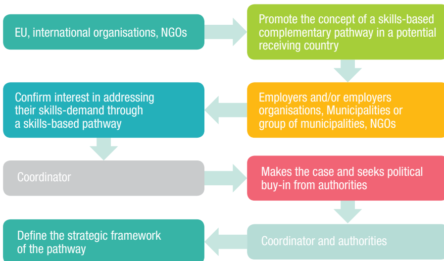
Figure 1. Steps in shaping the decision-taking

A specific demand-led skills-based pathway is subject to a receiving country decision applying such an approach. Figure 1 provides an overview of the main steps in shaping decision-taking. The flow is shaped based on the assumption that the whole process is triggered by the EU, international organisations or NGOs. In the case of national authorities initiating such a process, seeking political buy-in becomes redundant. However, the public authorities would still need to promote the concept to employers.