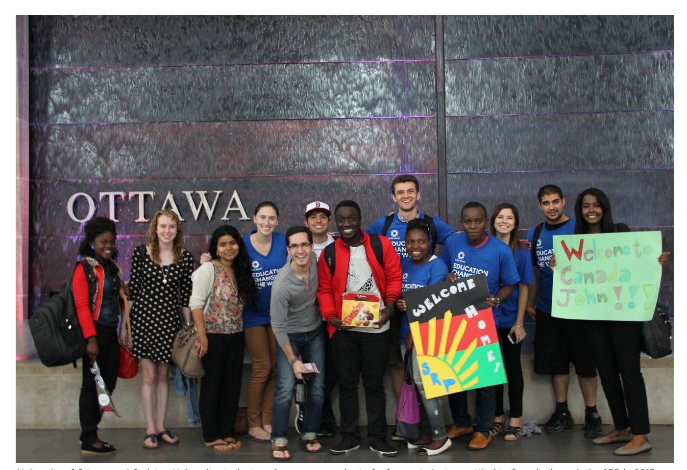
University of Ottawa and Carleton University students welcome a new cohort of refugee students resettled to Canada through the SRP in 2015

To ensure that these initiatives are a success, engage host community students and communities . Local communities and students should be involved in the development and planning for education pathways programs to the greatest extent possible. Community ownership can help to minimize perceptions of refugee students as a threat or unwelcome. Higher education institutions should build strong partnerships with student groups and support campus engagement, public awareness and refugee and host community integration.