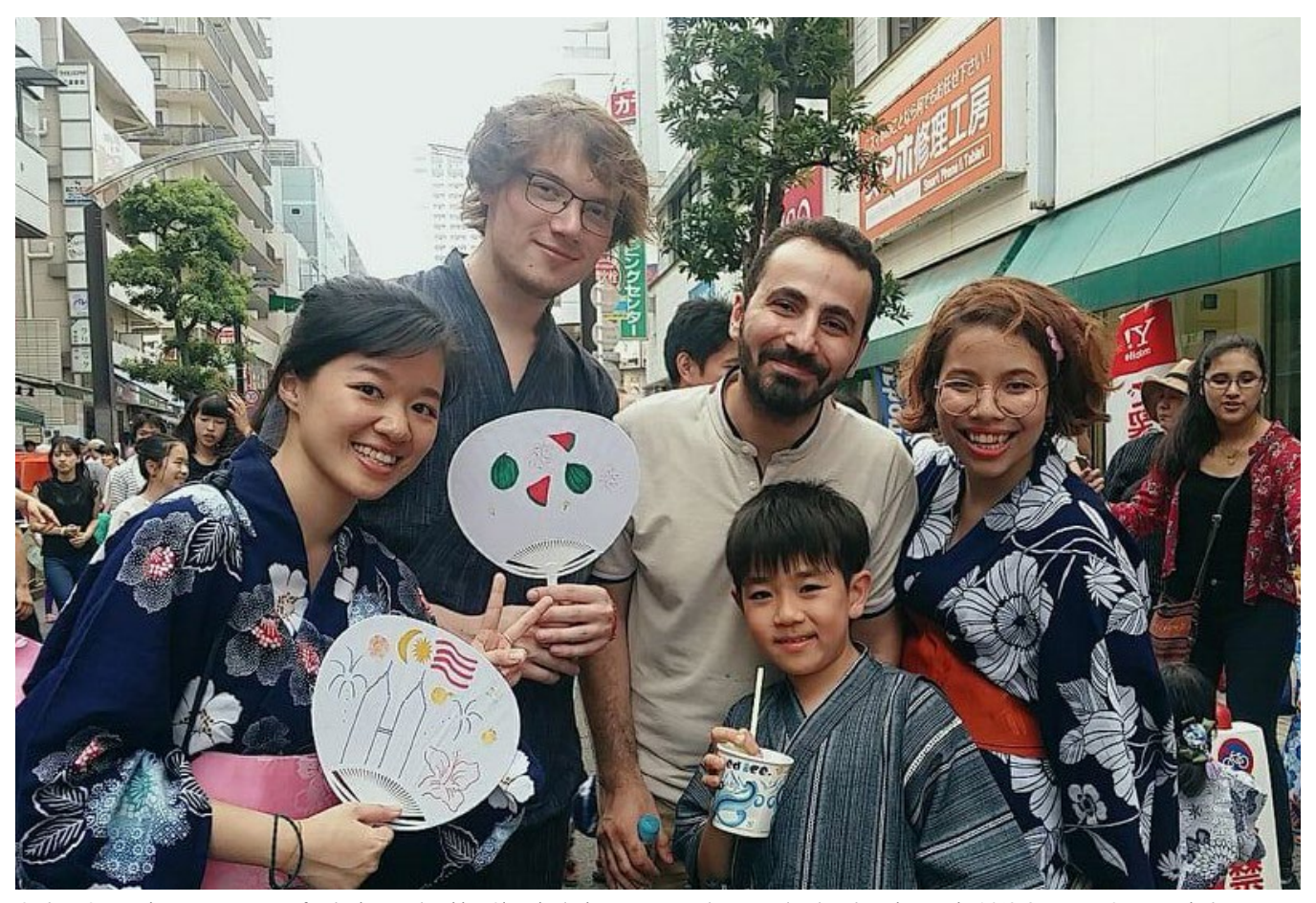
Syrian ICU student at a summer festival organized by Glocal Mitaka, a community organization, in Tokyo, July 2019